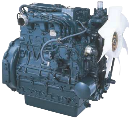
Photograph may show non-standard equipment.